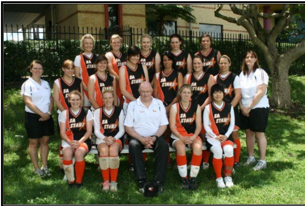
(Round 1 – Brisbane)