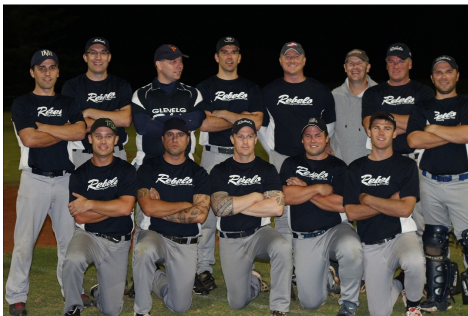
2011/12 MFSA Premiers – Glenelg Rebels