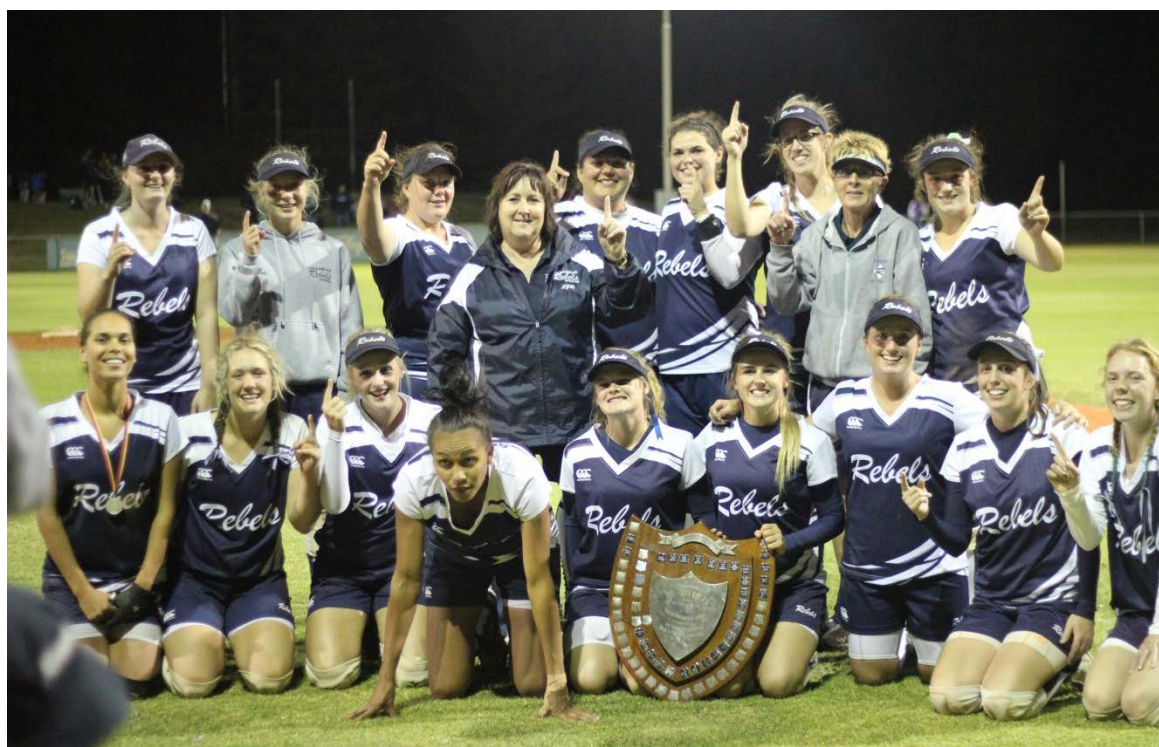
2011/12 Adelaide Competition Premiers – Glenelg Rebels