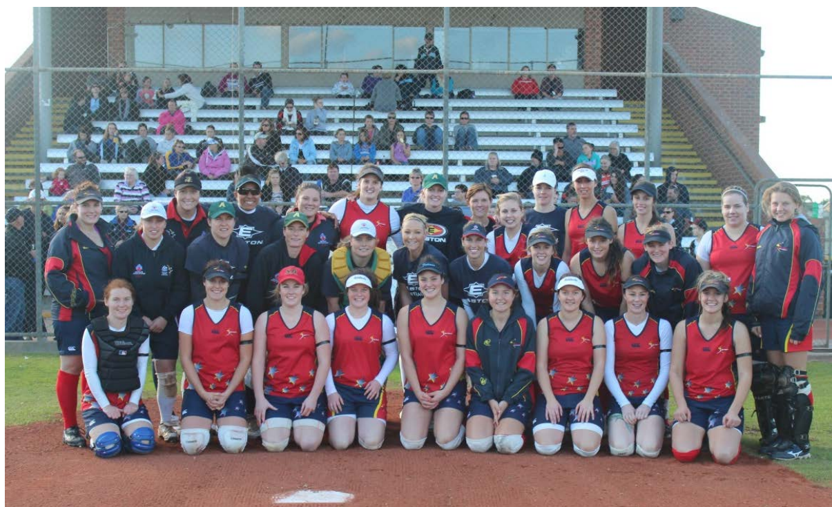
Aussie Spirit visit in June as part of their preparation for the 2012 World Championships. 3 game series against the SA Starz