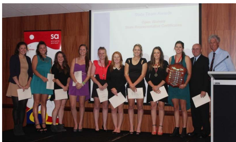
SA U19 Women's Team at the 2011/12 SSA Awards Night