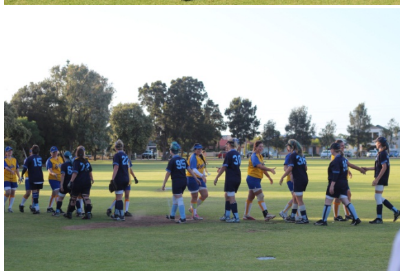
Adelaide Competition Grand Final Day 2012