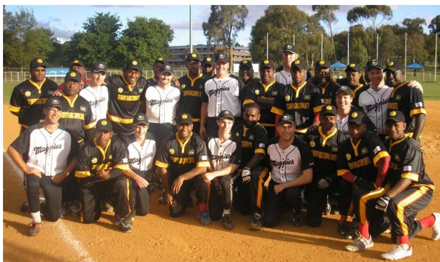
The Hahndorf Magpies were invited to play Papua New Guinea at the Canberra Skins in December. Hahndorf won 4-3

Softball SA would like to thank everyone who was involved during the weekend; the championships were a great success due to incredible support from participants, affiliates, staff and attendees.